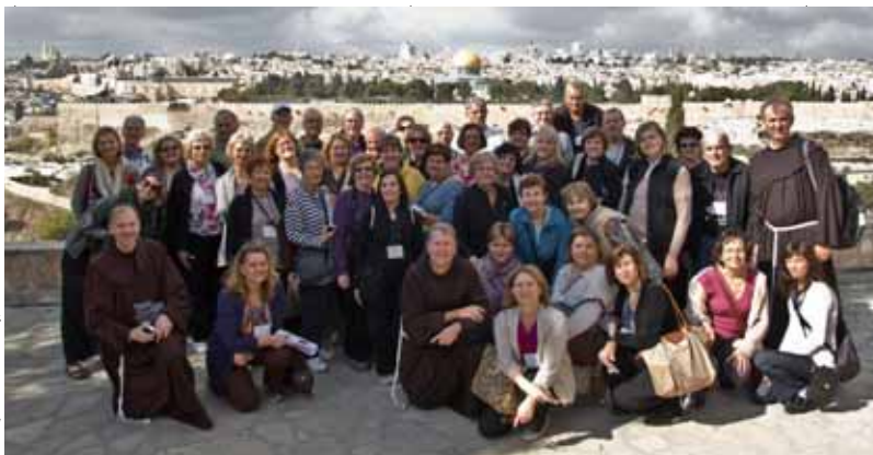
On Mt. of Olives with Jerusalem's walls in background

Most people know that there are four Gospels: Matthew, Mark, Luke and John. What most people don't know is that there is a "fifth Gospel" as well. That fifth Gospel is the land itself. That land, made sacred by Jesus, which we call the Holy Land. Walking through this land is like reading the Gospel stories all over again, through its rocks and stones, rivers and lakes, hills and valleys, mountains and deserts, towns and villages. This land makes the Gospels come alive in a new way in our minds and in our hearts. When we walk the streets of Jerusalem, when we stand at the shore of the Sea of Galilee, when we wander the streets of Bethlehem, Nazareth or Cana, when we stand on the summit of Mount Tabor, we are able to ponder the great mysteries of the life of Christ more deeply, with greater awe, wonder and understanding. My hope is that, as you read this account of our St. Jerome Parish pilgrimage, your heart too can be touched in some way by our experience. As we, the pilgrims from St. Jerome, allow